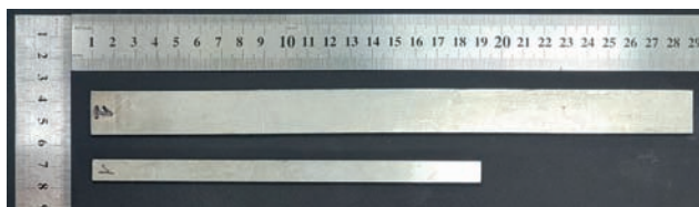
Figure 1. The types of TPCM samples under study are from the top a sample measuring 280mm x 20mm x 0.8mm and from the bottom a sample measuring 180mm x 10mm x 0.8mm

280mm x 20mm x 0.8mm and 180mm x 10mm x 0.8mm cut from one plate by guillotine were investigated.