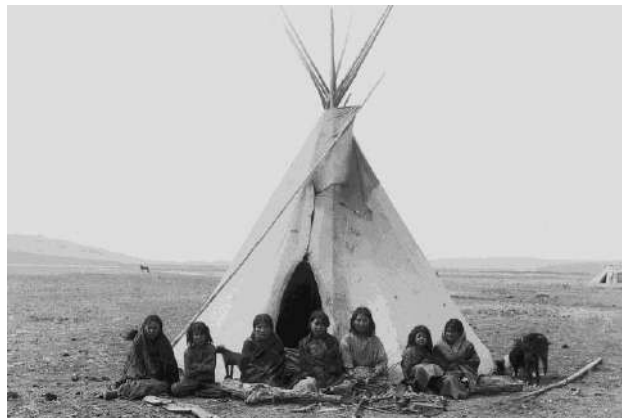
Figure 6. Chum is the dwelling of the humans of the north.