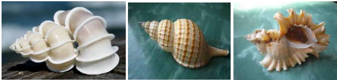
Figure 3. Shellfish Shells.