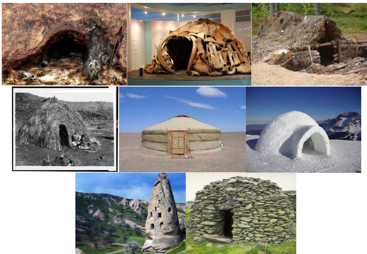
Figure 1. Evolution of human habitation.

The impacts to humans are increased. That manifests itself in the form of cosmic radiation on the human body, which leads to increased fatigue, headaches, irritability. In the course of medical research, it has been established that the prolonged affecting of variable electromagnetic fields on the human body causes disturbances in the cardiovascular and nervous systems. Its manifestation affects to the decrease in performance and reduced accuracy during operation, as well as in accelerated human fatigue. The effect of a variable magnetic field on the human body is manifested in pains in the region of the heart and in headaches.