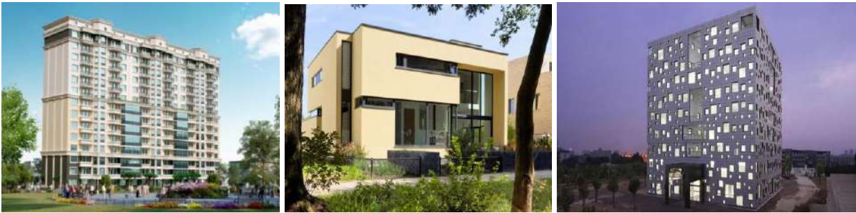
Figure 7. Modern residential buildings.

The configuration of the dwelling deserves special attention. Creating the safe and comfortable dwelling the humanity, since the most ancient times, imitated the animal world and nature and used the protective functions inherent in them (Fig. 2-6).