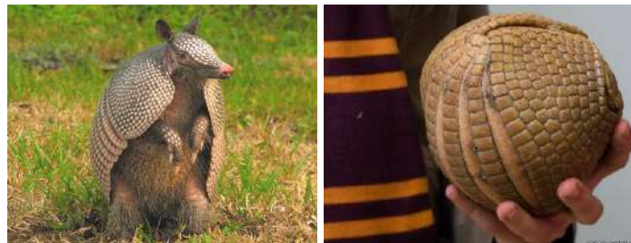
Figure 5. Armadillo Transformation.