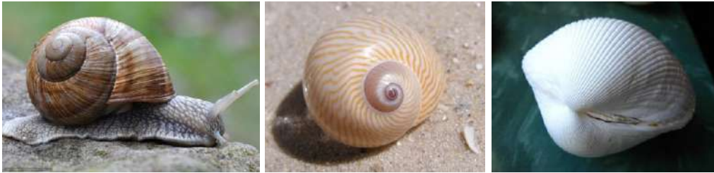
Figure 2. Clams with shells.