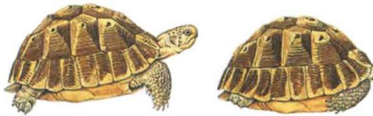
Figure 4. Turtle transformation.